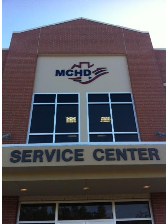
The MCHD Service Center entrance.