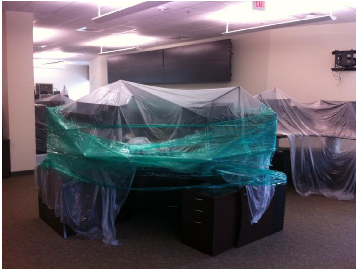
The Communication Center begins to take shape.