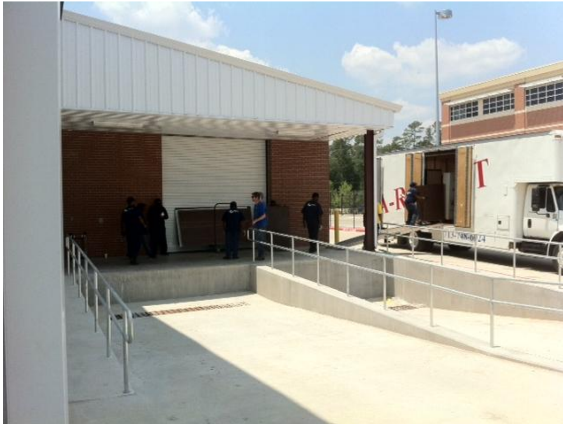
The movers bring over the last load to finish out the service center move.