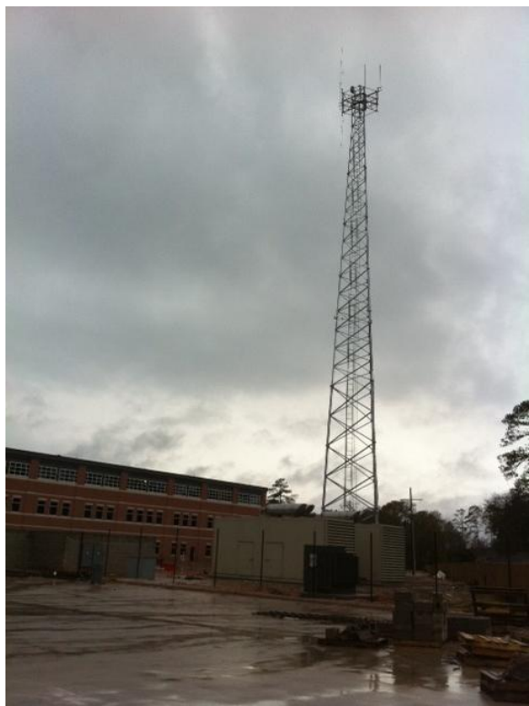
The on-site tower.