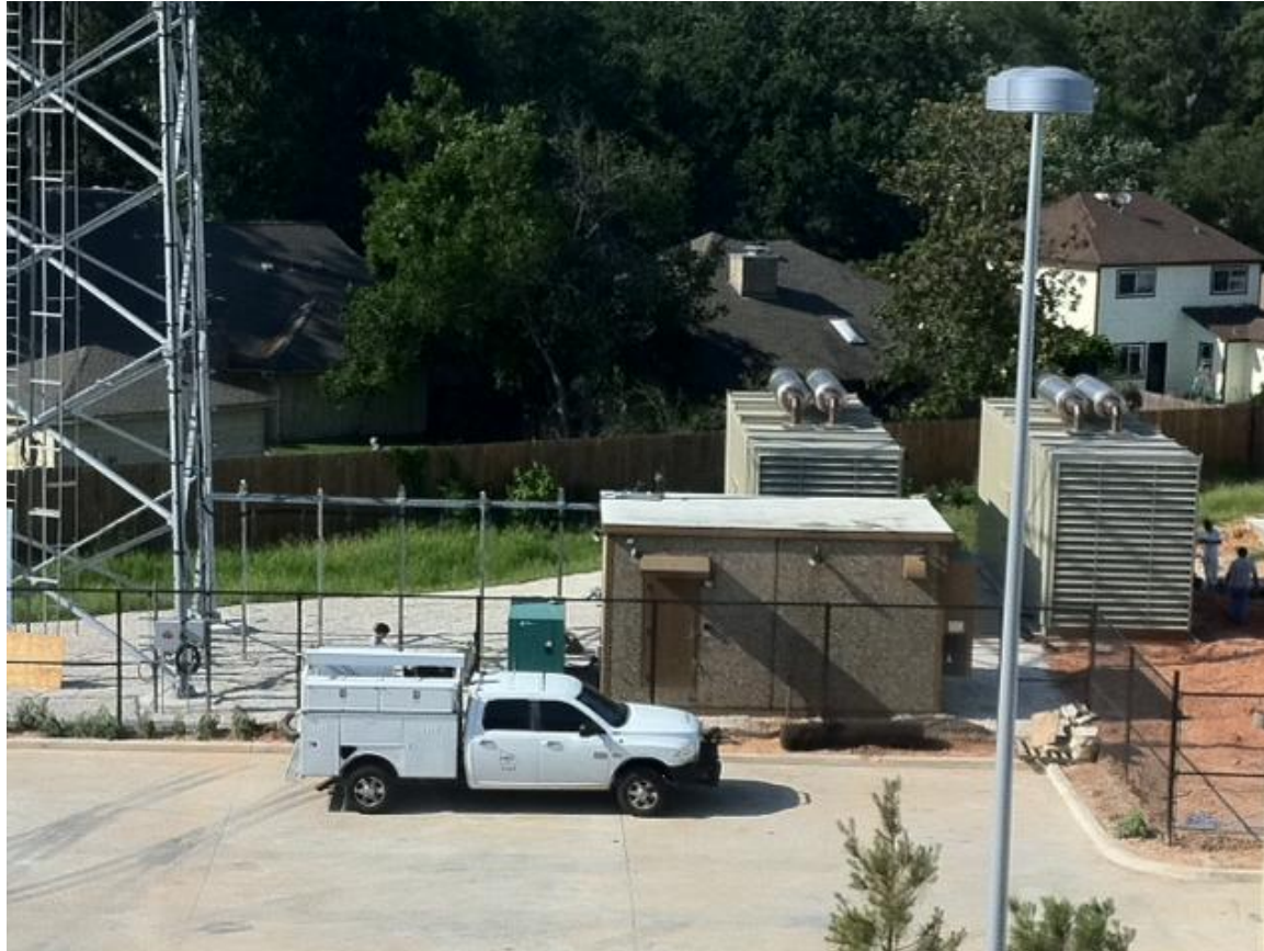
Our new backyard.