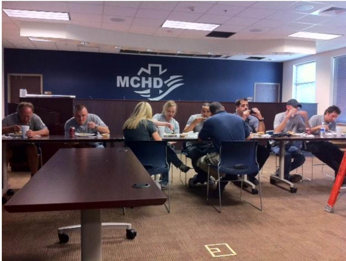
The move team refuels during lunch on move day.