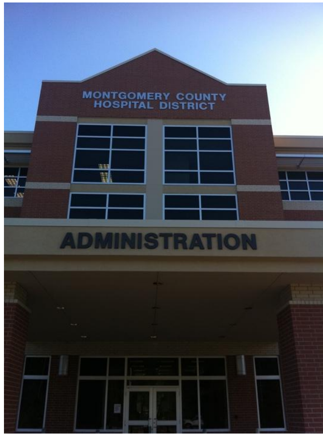
Administration building front