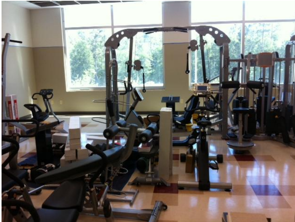
The Wellness Center